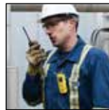
Easy To Wear