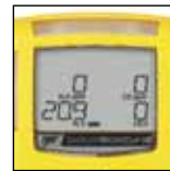
Easy to Read