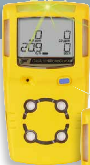
GasAlert MicroClip X3

Guaranteed to run for an entire shift — even in harsh weather.