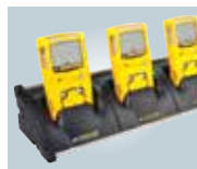
Five unit cradle charger

For a complete list of kits and accessories, please contact BW Technologies by Honeywell.