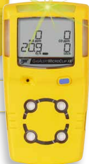
GasAlert MicroClip XL

NEW! GasAlertMicroClip Series now features IP68 for maximum water and dust protection.