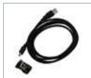
IR connectivity kit