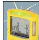
Easy to See