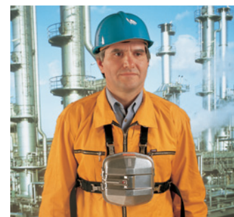
SSR 30/100 B