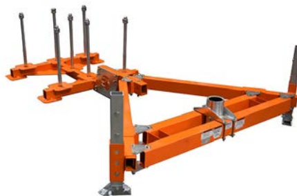
Part Number: WEIGHT30 x12